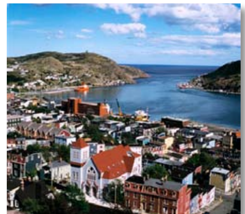
St. John's, Newfoundland

The transition to practicing in Canada is challenging. The system is designed for universal health care and therefore is unique in the way models of practice are organized. You may discover learned behaviours that you might take for granted. For example, your beliefs about aging and/or expectations around family support may differ greatly from the Canadian use of home care or nursing home facilities. You may notice for example that being therapeutic in Canada includes setting limits and appropriately challenging clients. Recognizing when judgments are influenced by a different set of cultural values will help you to strike a personal balance. Take the time to engage in conversation by confirming, questioning and elaborating.