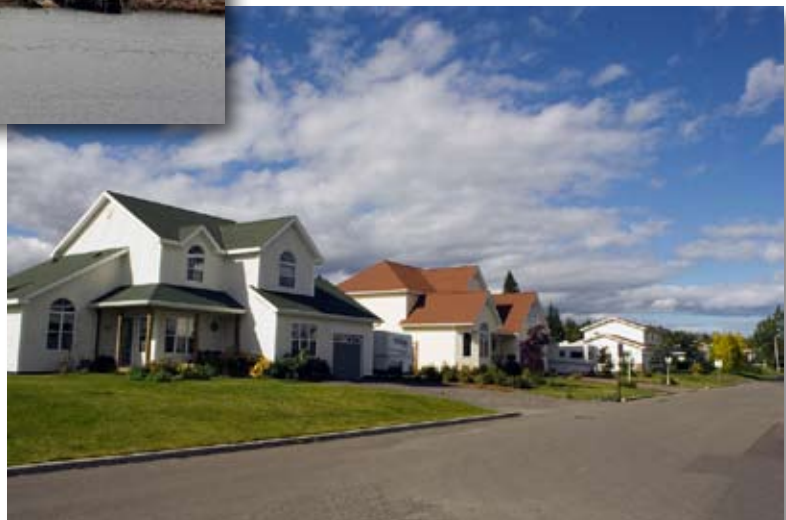
Street in Lewisporte, a town in Notre Dame Bay.