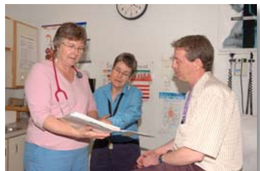
Health Care professionals consulting.

Consultation between physicians is common practice. You will find that physicians acknowledge to clients when they do not have the information required and either seek it out or refer the client to an appropriate colleague. A referral is usually requested by writing a letter to a colleague and by scheduling an appointment on behalf of the client.