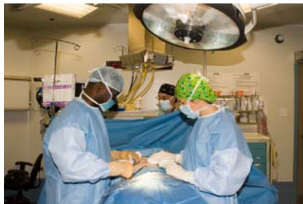
OR, Central Newfoundland Regional Health Centre

The Canadian Medical Association's (CMA) “Code of Ethics” can provide insight into physician responsibility in the Canadian system. It lists your fundamental responsibilities as a physician, including your responsibilities to the patient and the patient-physician relationship. It provides guidance on such things as communicating with the patient, decision-making about care, and the need for patient consent. The right to privacy and confidentiality are discussed, as well as, a physician's responsibility to society, the profession, and oneself.