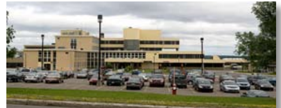
Central Newfoundland Regional Health Centre

The Newfoundland and Labrador Health Boards Association (NLHBA) operates as a central agency that offers programs and services to use the collective size of the health and community services system to achieve efficiencies and cost-savings in areas such as physician recruitment, collective bargaining labour relations, human resource planning, group purchasing and others.