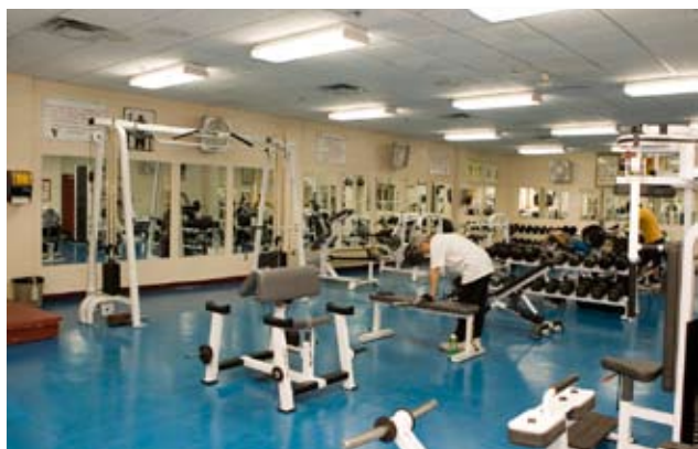
YMCA, Grand Falls-Windsor

... may over-generalize the friendship of small community life and feel comfortable approaching a physician with a medical problem at any time- even when you are shopping walking or attending a local event. You will need to decide on an appropriate response.