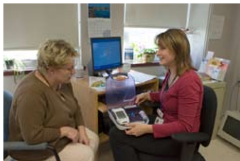
Diabetes Education, Grand Falls-Windsor