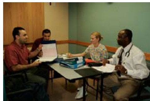
Accurate records are an important aspect of health care.

Many IMGs quickly recognize the challenges of medical literacy within the Canadian medical system. Initially, you may struggle to communicate medical information, the related reasoning, and your conclusion in a concise and coherent way. The Subjective Objective Assessment Plan (SOAP) is recognized as the most appropriate way to document medical information.