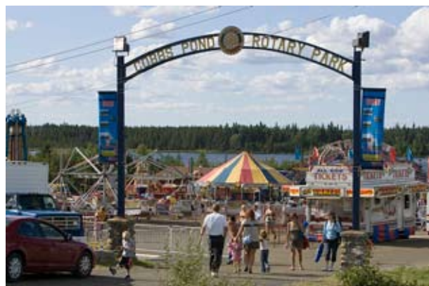
Cobb's Pond Rotary Park, Central Newfoundland