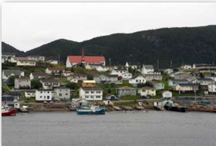
Harbour Breton, Newfoundland. One of the province's many small scenic communities.

In addition, the province provides considerable help with the immigration process through our “Provincial Nominee Program” . This year also introduces a new service hosted by the Association for New Canadians, a “Resource Development Officer”, whose role is to assist physicians and their families to become established in our communities.