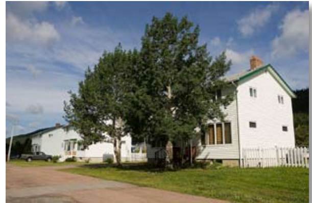
Physicians housing units, Baie Verte