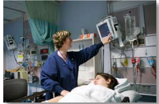
New mother recovering after giving birth