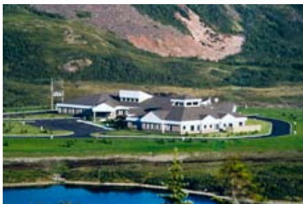
Connaigre Peninsula Health Centre, Harbour Breton

Canada's national health insurance program, often referred to as " Medicare ", is designed to ensure that all residents have reasonable access to medically necessary hospital and physician services on a pre-paid basis. Instead of having a single national plan, we have a national program that is composed of 13 interlocking provincial and territorial health insurance plans, all of which share certain common features and standards of coverage. In NL this is the Medical Care Plan (MCP). The Canada Health Act describes the underlying values of our federal health insurance. The following has been selected from information provided on the Government of Newfoundland and Labrador and Canadian Information Centre for International Medical Graduates websites.