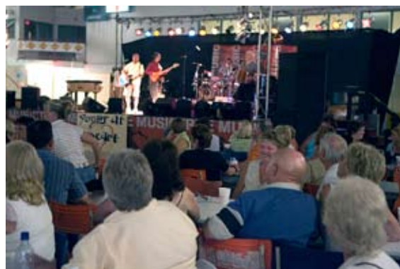
Local performers entertain at a summer festival

... do not consider it disrespectful for young people to use first names when addressing older people whom they know well. Even in medical settings, you may see this type of familiarity between generations.